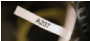
Flexible-ID Tape Use on curved surfaces, sharp bends or cylindrical surfaces.

In addition to the extensive range of TZe tapes in various colours and sizes, special tapes for industrial use have been developed for specific labelling tasks.