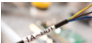
Heat-shrink tube Shrinks and grips cable when heat is applied.